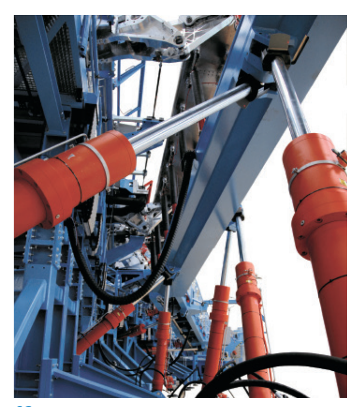
02 Ratio Clamp in use: Testing elements on aircraft wings