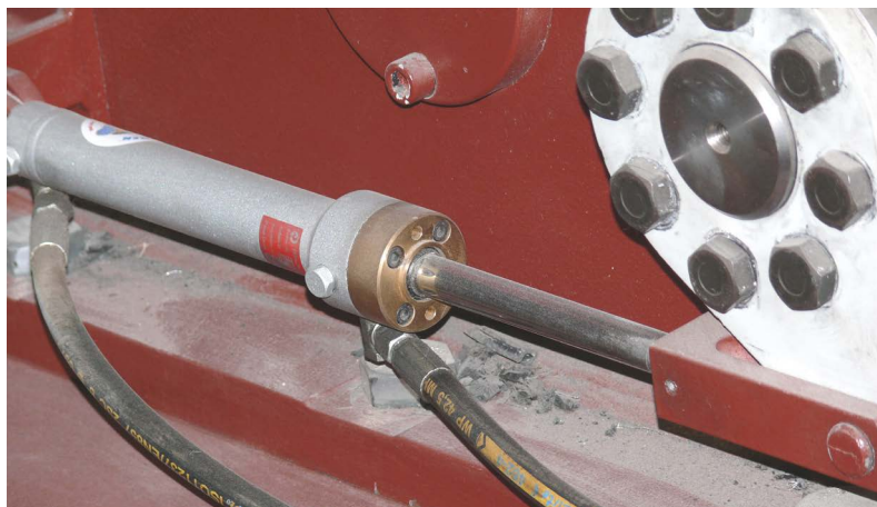
2 | In this shredder test, the negative impact of dirt and a rough environment becomes visible.

a degree of purity of 98%. Three to four work steps are typical for the Zweibrücken company: rough shredding to a size of maximum 150 mm, separating the compounds, fine granulation and, if required, ultrafine granulation. In any case, this is one work step less than the market standard. As common in the industry, the general conditions are extreme: large forces shred basically unpredictable materials in an extremely rough environment. All components are subjected to dirt, dust and also chemically aggressive substances. As the flaps, screens, rotors and shredding units have to withstand extreme forces and are very heavy, hydraulics are indispensable. "Especially in the recycling sector, components have to work according to the principle 'install and forget'. This is because the end users of our systems may be working on a different continent and often do not have specialists at hand that can expertly exchange the seal on a hydraulic cylinder," points out Dietrich. "After the corresponding experiences gained with other suppliers, we therefore opted for hydraulic cylinders by Hänchen for sophisticated application fields. For example, they have been in use at a Spanish tyre recycling company for ten years now without requiring any maintenance or showing any signs of wear."